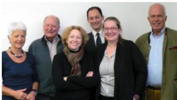
Founding team members on day of foundation

PTF decided to support the establishment of a sister organisation in Europe (PTF e.V.) in order to attract new members, engage in European anti-corruption networks, develop new partnerships and attract grants and other modes of cooperation from European organisations.