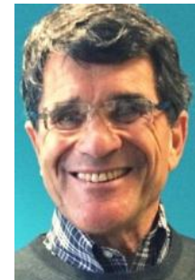
President and CEO of PTF