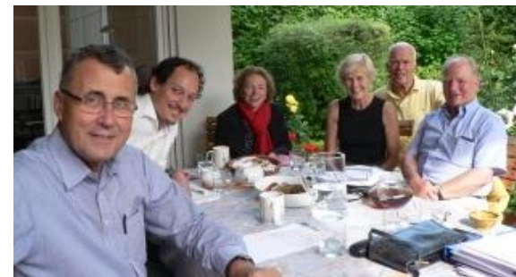
PTF e.V. members during a meeting