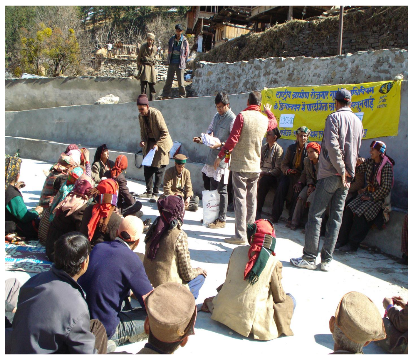
Jansunwai in progress in Gram Jakhol in Mori block in district Uttarkashi