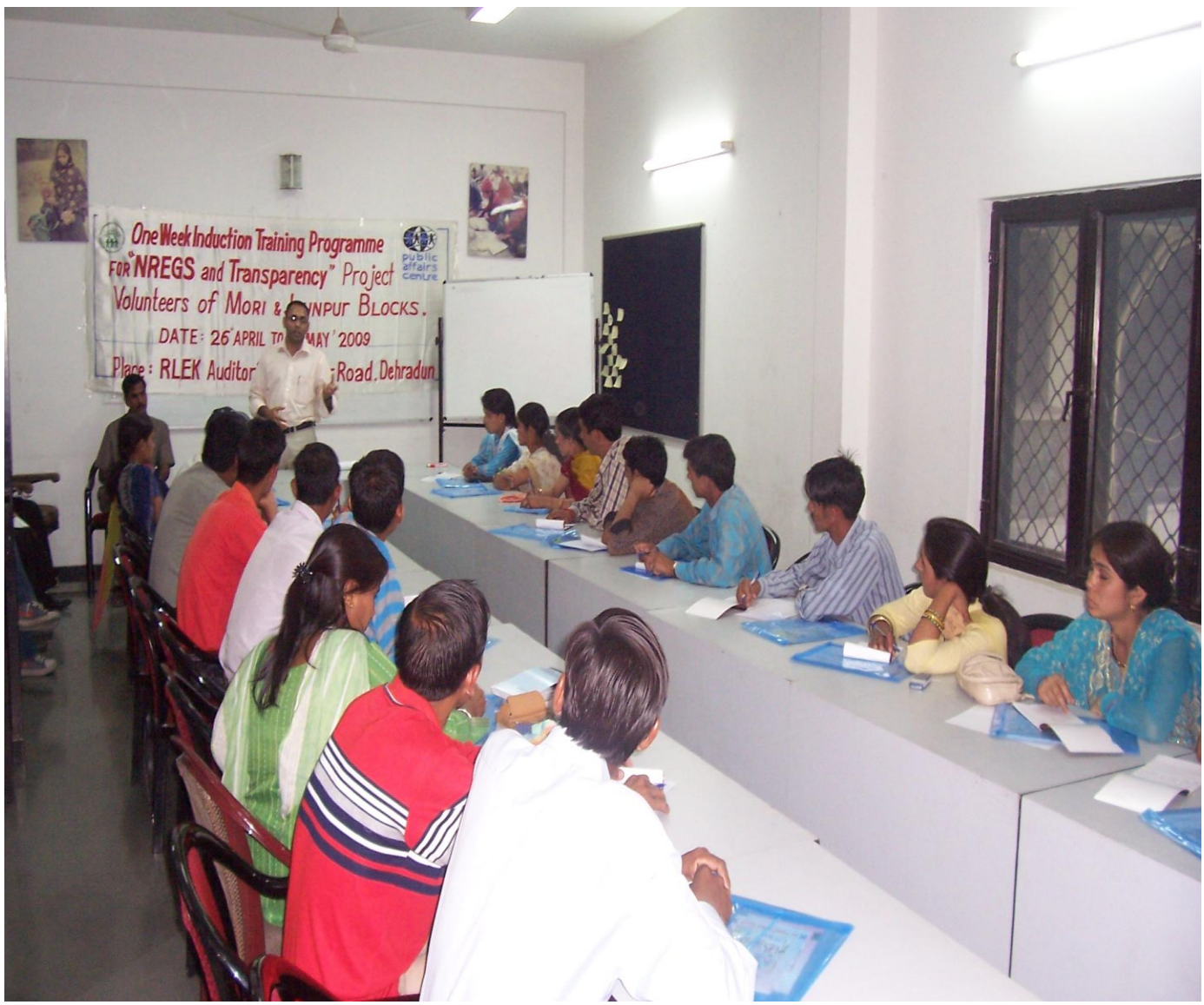
One week induction training of volunteers from the project area in progress that was conducted at the beginning of the project

Reflections from the field about the progress of community mobilisation camps and Jansunwai held in Jaunpur and Mori blocks in the districts of Tehri Garhwal and Uttarkashi respectively.