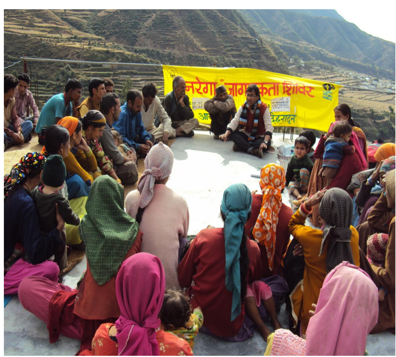
Community mobilisation camp in progress in Khasaunsi village of Jaunpur block in district Tehri Garhwal