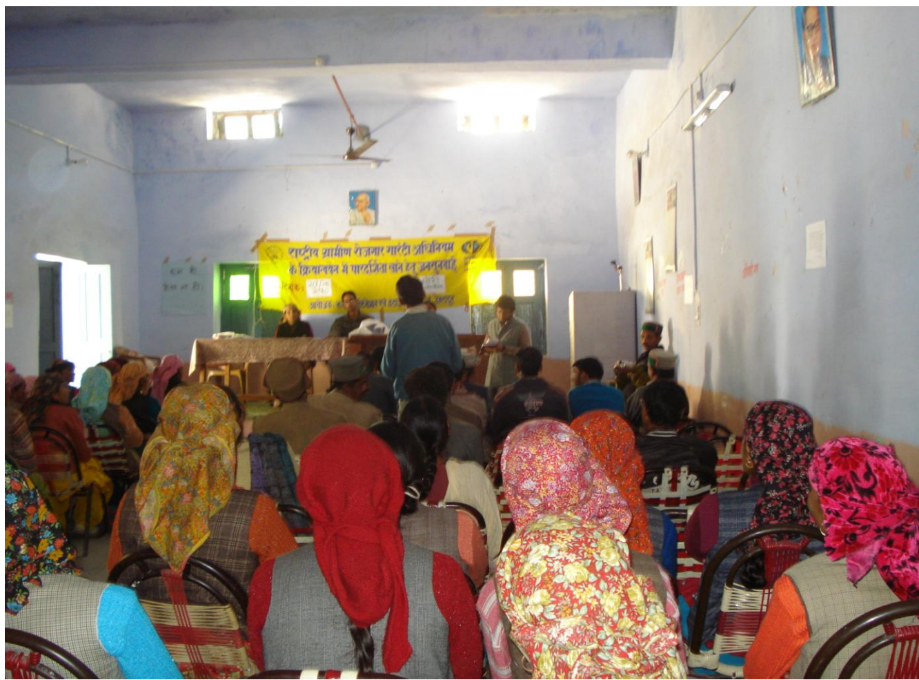
Jansunwai in progress in the presence of Development Planning Officer MGNREGA in Mori block in district Uttarkashi