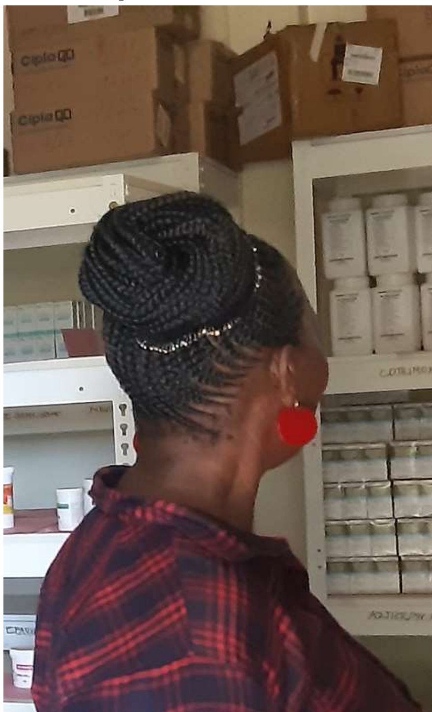
PHOTO: Monitoring the public medicine store as part of the Health Transparency Initiative in Kasangati, Uganda.