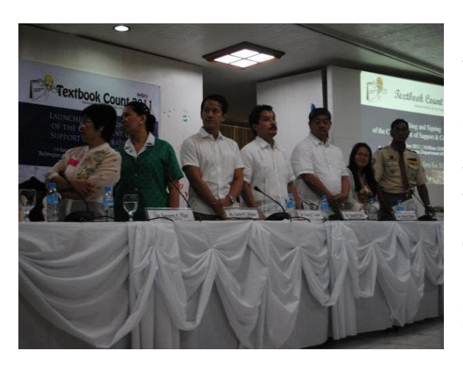
Representatives coming from different partner organizations stand for the official re-launching of Textbook Count

2. Convening of the Textbook Count National Coordinating Group and Re-launching of the Textbook Count and Textbook Walk